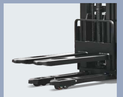
Tandem load wheel